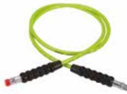
AP Hydraulic Hoses