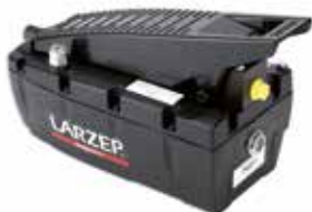
Z12107 Air Hydraulic Pump