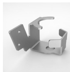
M4933 Extension Holder Right