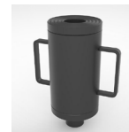
M4938 Extension 250 mm