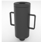
M4939 Extension 300 mm