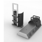
LBS80 Load block Set 3x M4905, 1x M4906, 1x M4907, 1x M4923