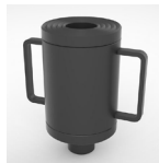
M4937 Extension 150 mm